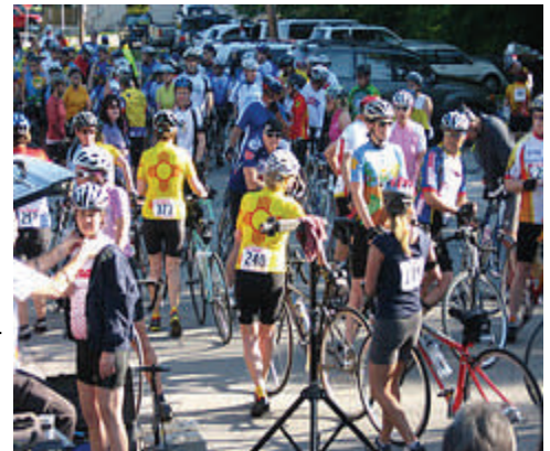
Cyclists preparing for the 50 mile ride

While the day is about cycling and fun, it is also about raising money and awareness for those infected and affected by HIV/AIDS. To date the Ozarks Red Ribbon Ride has raised an amazing $100,000 in just five years! Because of the money raised at the bike ride we can continue to provide services to those in need in Southwest Missouri.